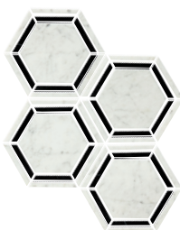
BLACK/WHITE BLEND M753 6" Hexagon Mosaic Polished