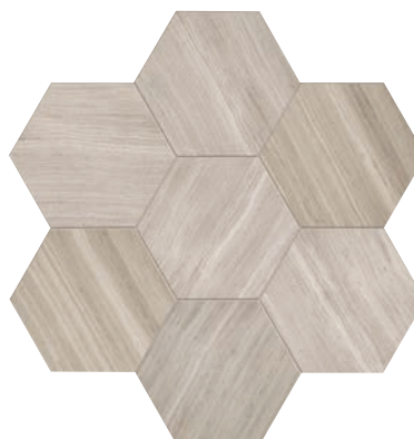
CHENILLE WHITE L191 18" x 20-3/4" Hexagon – Honed