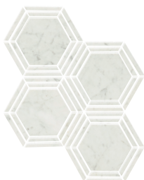
CARRARA WHITE M701 6" Hexagon Mosaic Polished