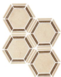
TORREON T711 6" Hexagon Mosaic Honed