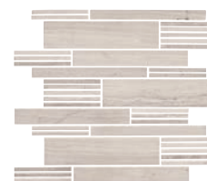
CHENILLE WHITE L191 Random Linear Mosaic* Polished, Honed & Scraped

* Mosaic can be cut into thirds to create interlocking decorative border