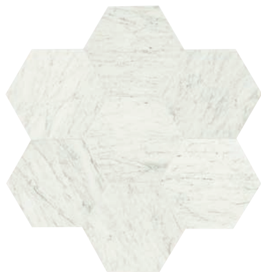
CARRARA WHITE M701 18" x 20-3/4" Hexagon – Polished