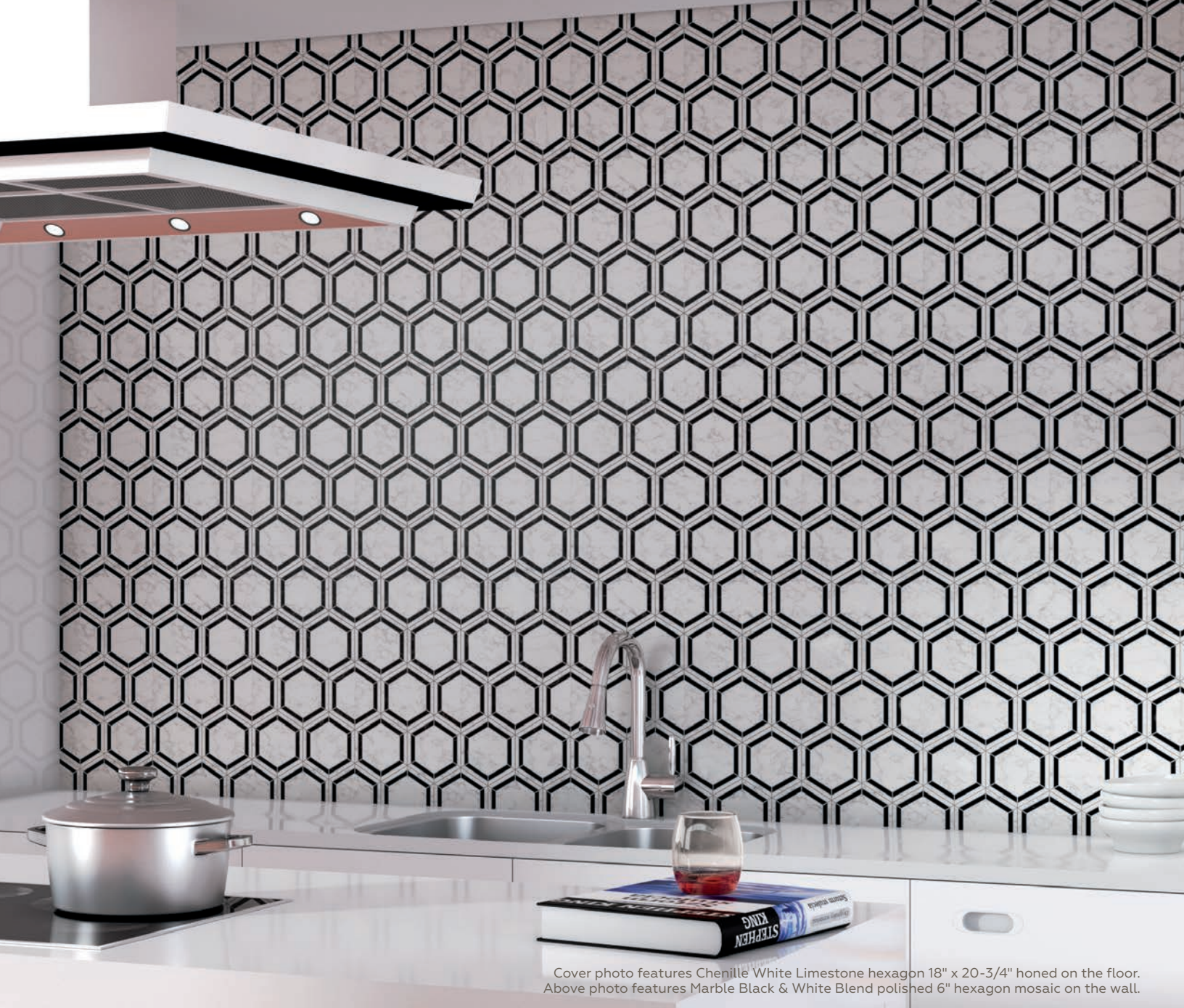
Cover photo features Chenille White Limestone hexagon 18" x 20-3/4" honed on the floor. Above photo features Marble Black & White Blend polished 6" hexagon mosaic on the wall.