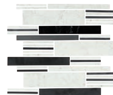
BLACK/ WHITE BLEND M753 Multi Random Linear Mosaic* Polished, Honed & Scraped