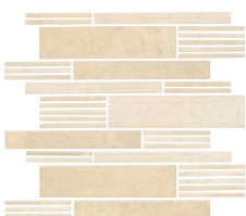
TORREON T711 Random Linear Mosaic* Polished, Honed & Scraped