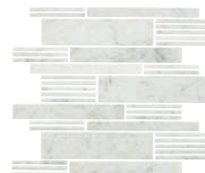
CARRARA WHITE M701 Random Linear Mosaic* Polished, Honed & Scraped