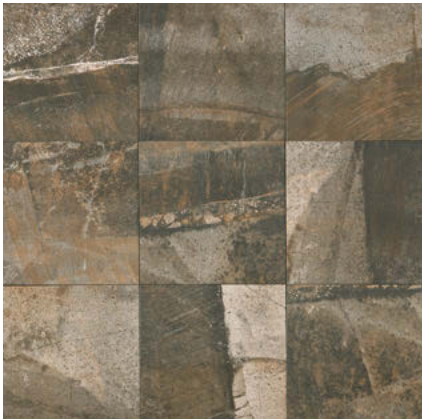
RICH BROWN PR32