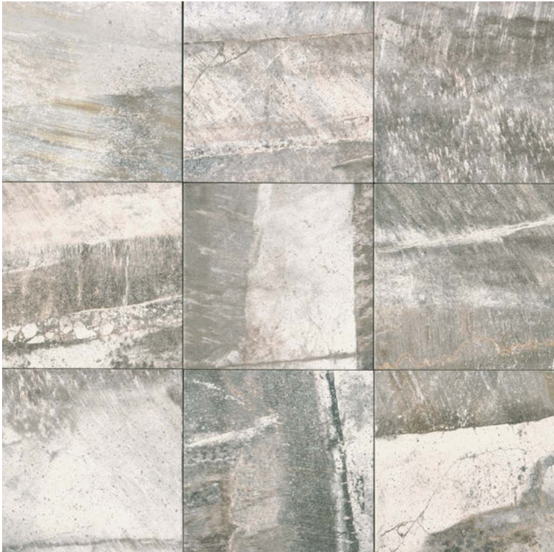
SUBTLE GREY PR33