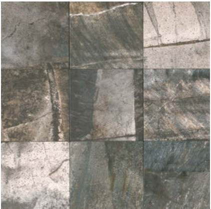
DEEP GREY PR34