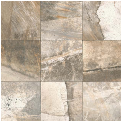
SOFT TAUPE PR31