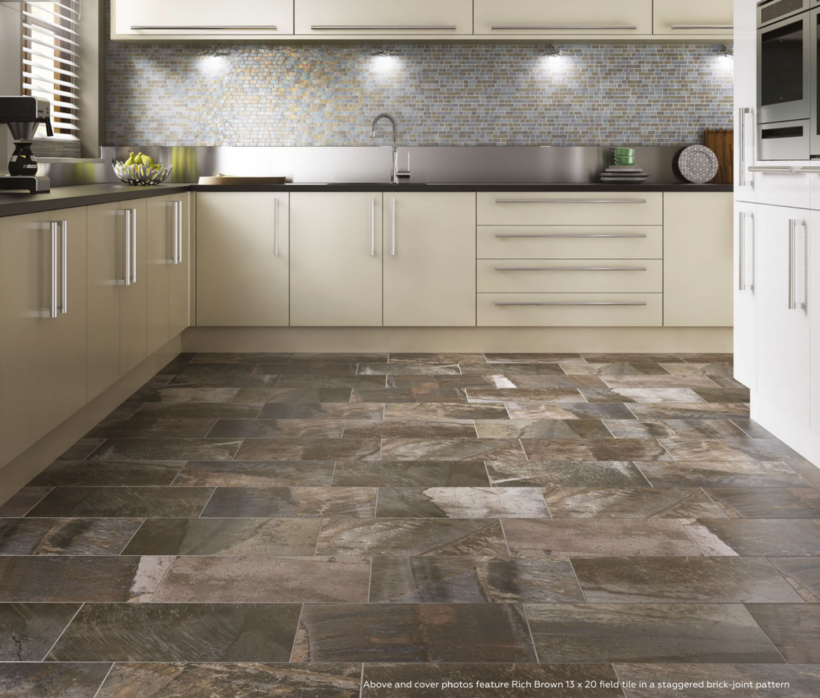
Above and cover photos feature Rich Brown 13 x 20 field tile in a staggered brick-joint pattern