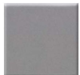
SUEDE GRAY 6453 (1)