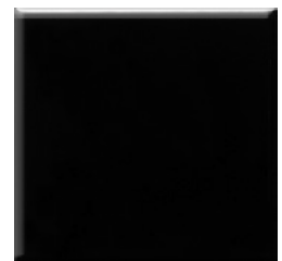
BLACK 6421 (1)