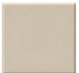
URBAN PUTTY 6461 (1)