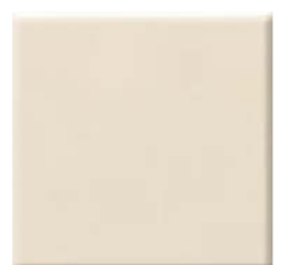
ALMOND 6465 (1)