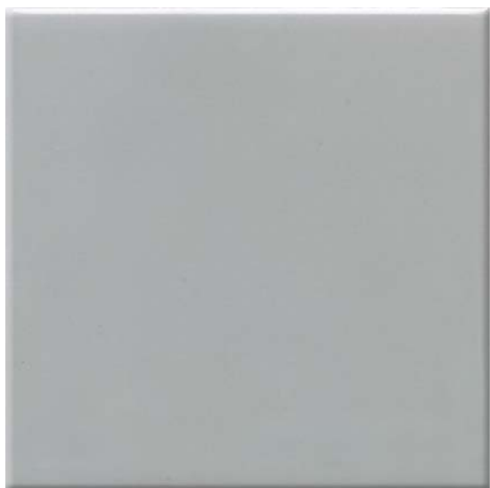
DESERT GRAY 6464 (1)