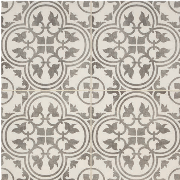
PETAL GREY ME20