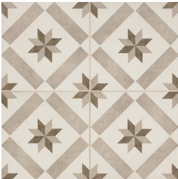
STAR GREIGE ME22