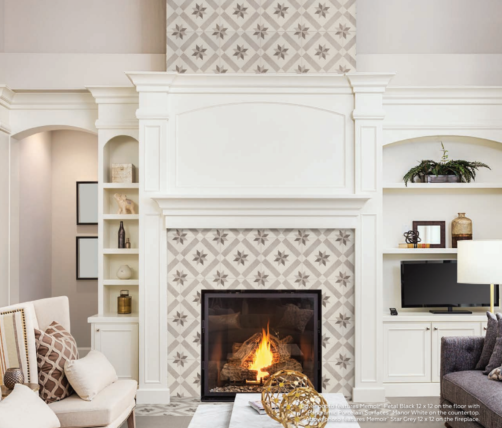
Cover photo features Memoir™ Petal Black 12 x 12 on the floor with Panoramic Porcelain Surfaces™ Manor White on the countertop. Above photo features Memoir™ Star Grey 12 x 12 on the fireplace.