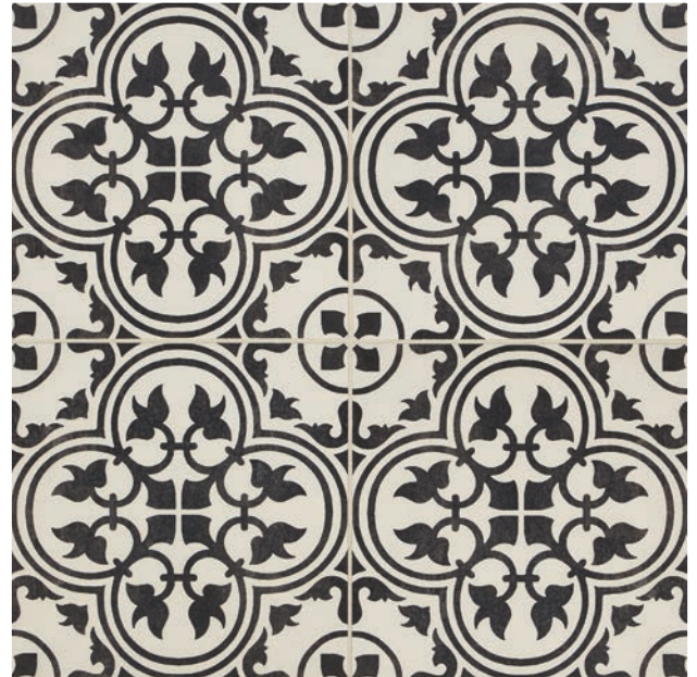
PETAL BLACK ME21