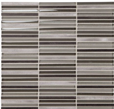
TWILIGHT GLEAM LS11