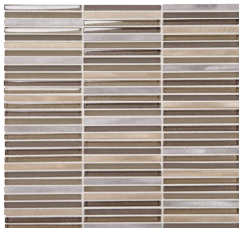
CRIMSON DUSK LS12