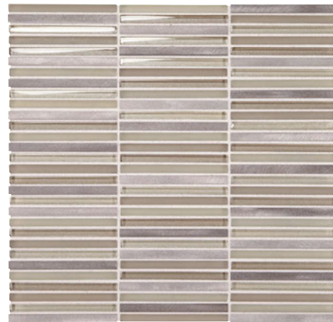
NIGHTFALL LUSTER LS10