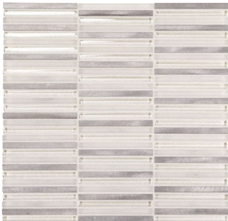
CELESTIAL WINTER LS08