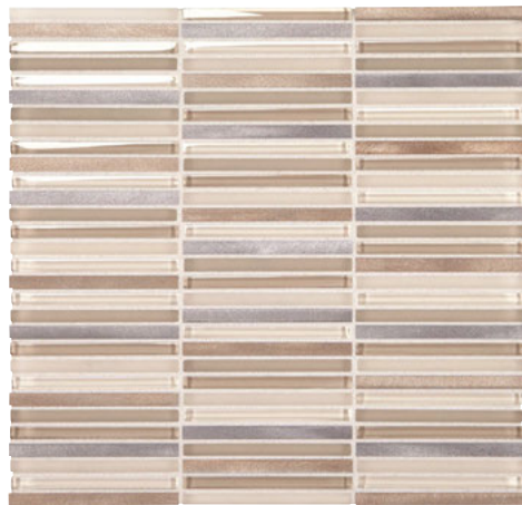
SUNLIT DAWN LS09