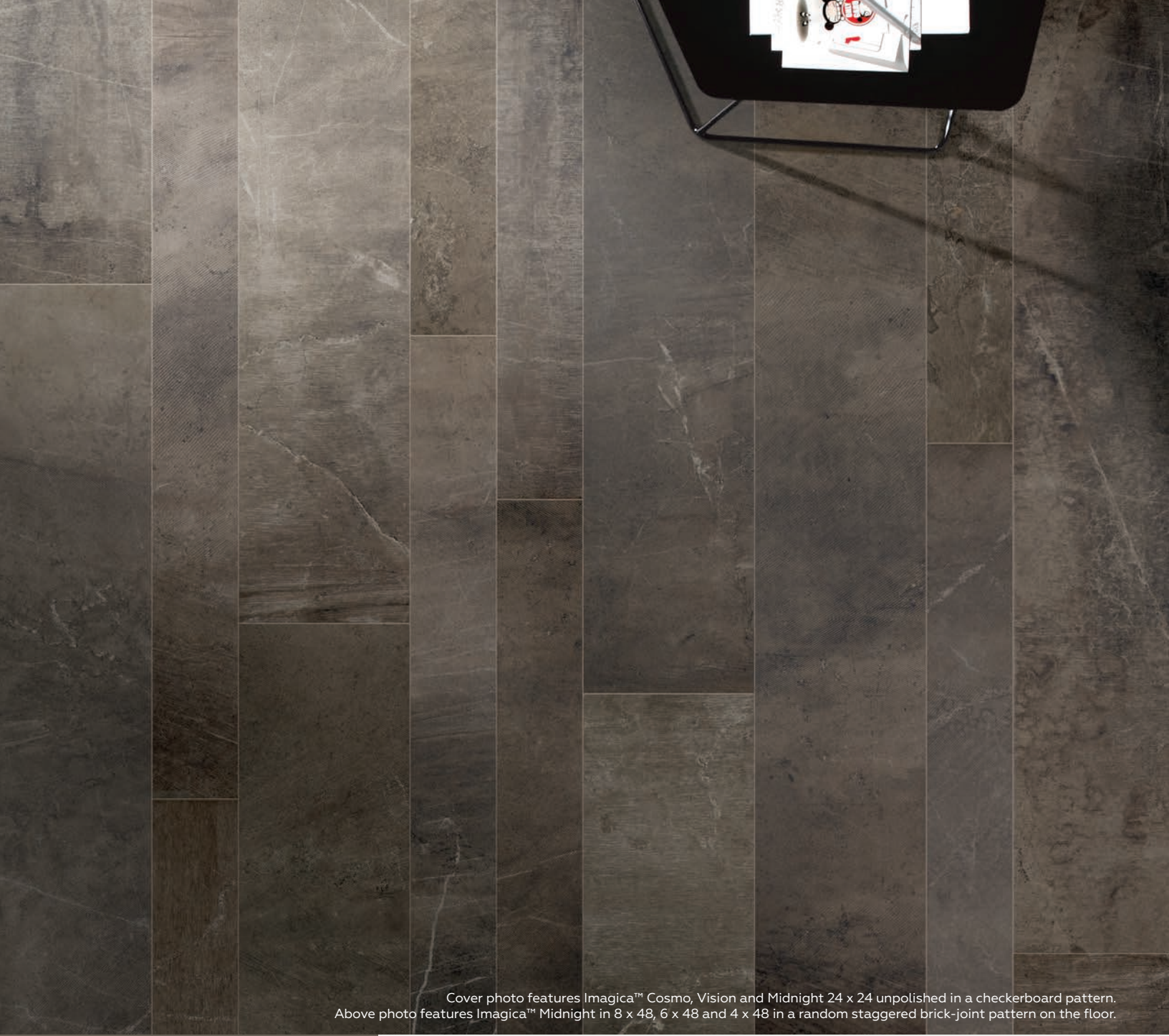
Cover photo features Imagica™ Cosmo, Vision and Midnight 24 x 24 unpolished in a checkerboard pattern. Above photo features Imagica™ Midnight in 8 x 48, 6 x 48 and 4 x 48 in a random staggered brick-joint pattern on the floor.