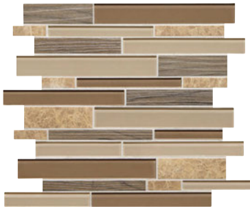
SYLVAN SUNSET IB02