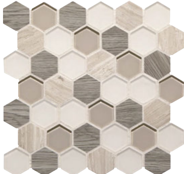
SERENE STORM IB04