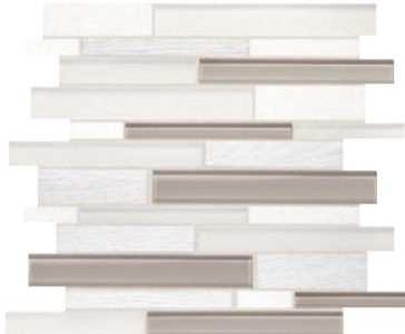
TRANQUIL SNOW IB01