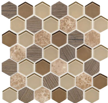
SYLVAN SUNSET IB02