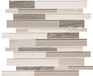
SERENE STORM IB04