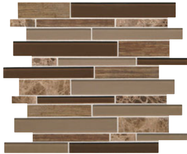
RUSTIC EVE IB03