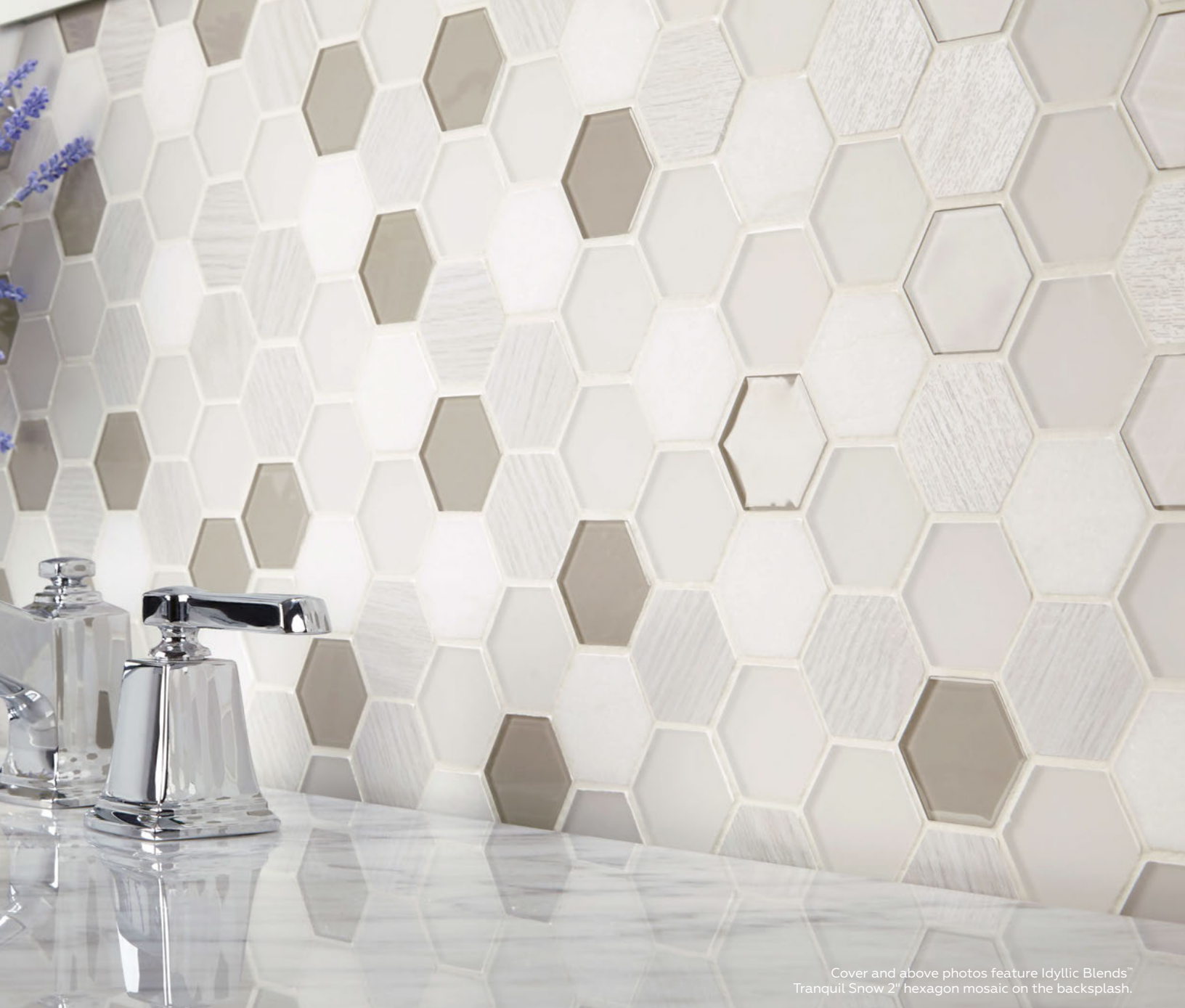
Cover and above photos feature Idyllic Blends™ Tranquil Snow 2" hexagon mosaic on the backsplash.