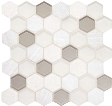
TRANQUIL SNOW IB01