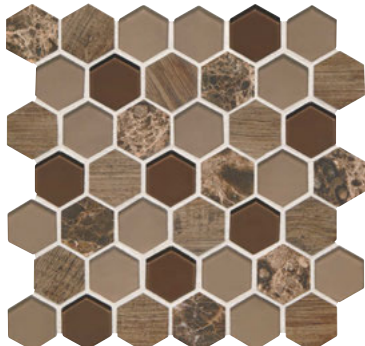
RUSTIC EVE IB03