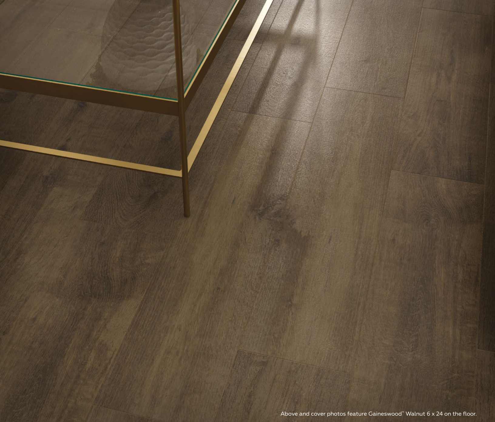
Above and cover photos feature Gaineswood™ Walnut 6 x 24 on the floor.