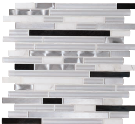
NEO CLASSIC F164