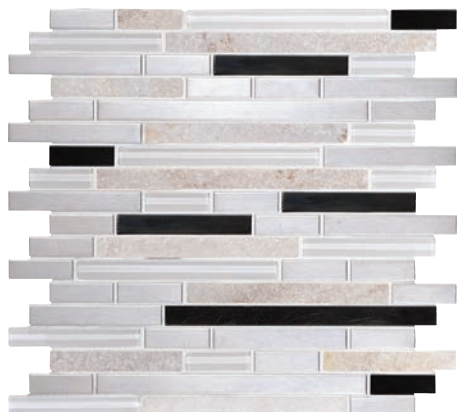
AVANT GARDE F163