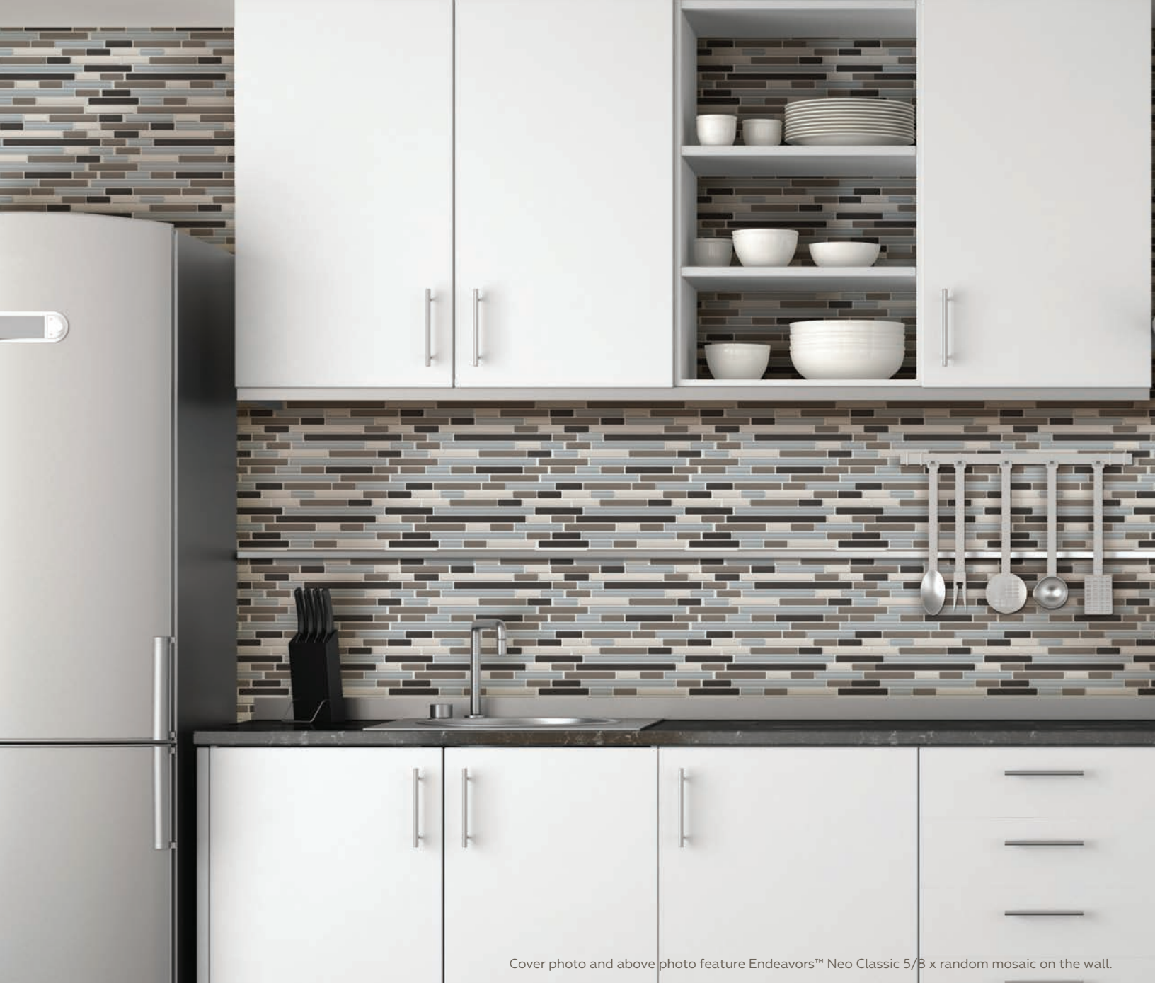
Cover photo and above photo feature Endeavors™ Neo Classic 5/8 x random mosaic on the wall.